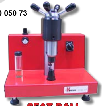
SEAT BALL RETAINING CONTROL